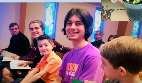
The Schmitt kids got to hang out with the Youth during the Senior Recognition service.