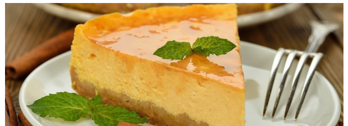
National Pumpkin Cheesecake Day October 21 www.NationalDayCalendar.com

Call 281-4600 for assistance on all other days.